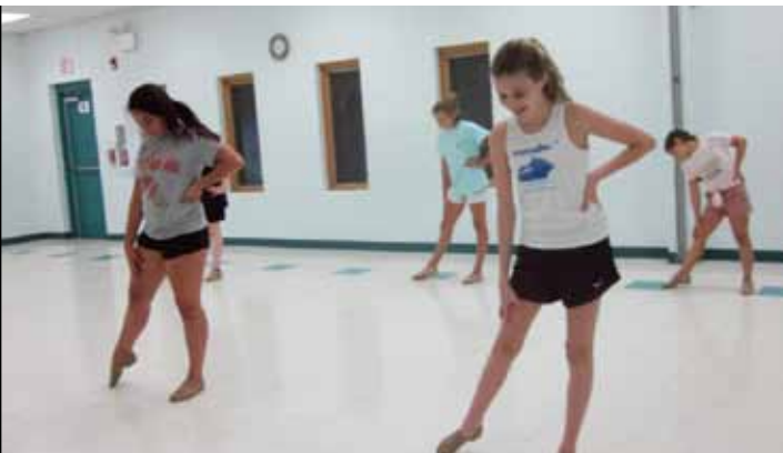
DANCE & POMS - PAGE 12 & 13