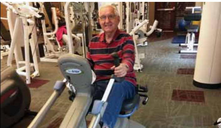
FITNESS CENTER INFORMATION - PAGE 14