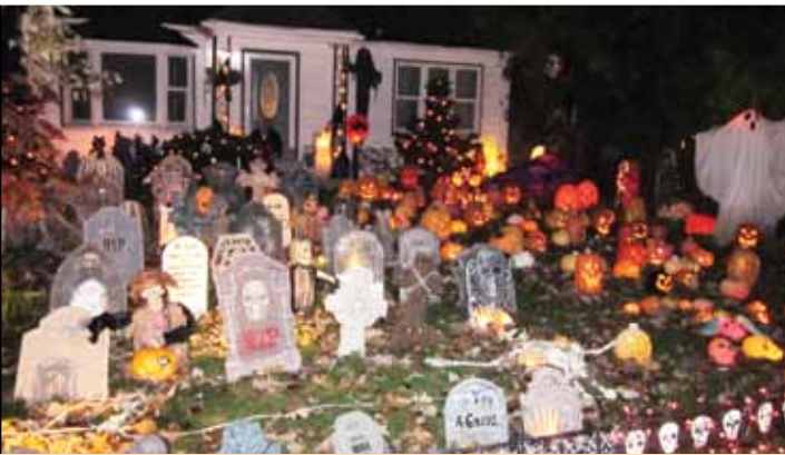
HOUSE DECORATING CONTEST - PAGE 2